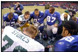
Giants' pre-game Prayer